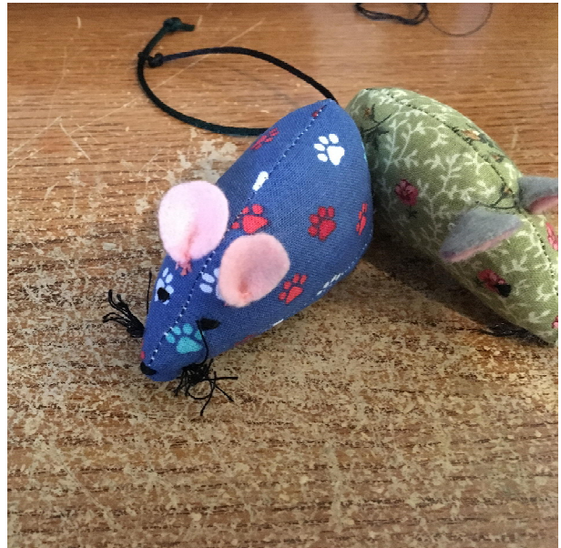
Finished Catnip Mouse