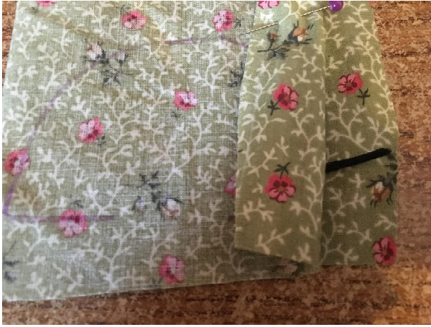
Photo shows tail placement on mouse body